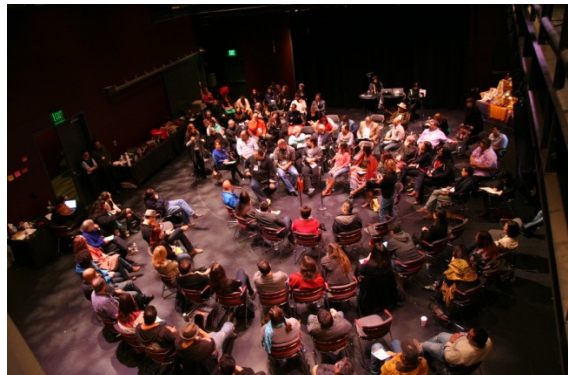
LTC National Convening

This book offers a detailed and accessible narrative account of what happened at the 2013 Latina/o Theatre Commons (LTC) National Convening, which was held October 31-November 2, 2013 at Emerson College in Boston, hosted by HowlRound. The first large-scale formal gathering of the Latina/o theater community since the convening brought over seventy-five Latina/o actors, directors, producers, playwrights, designers, and scholars representing all regions of the United States together to explore the history, current challenges, opportunities, and visions for Latina/o theater-makers in the 21st century.